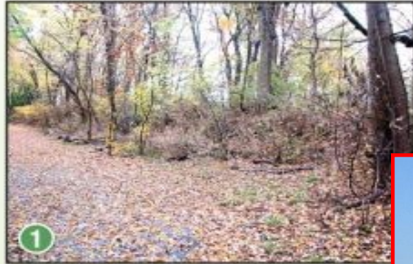
Section in orange to be paved in June